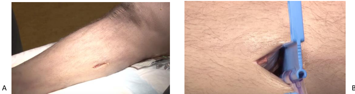
Fig. 4 A&B: The incision is placed on the medial aspect of the calf just above the level of the visible gastrocnemius musculotendinous junction. A) This is the location and view of the superficial fascia on a cadaver model. B) The view of the gastrocnemius fascia once the fascia is incised and the interval between the gastrocnemius and soleus is bluntly developed. The PiroVue guide is inserted at this point.