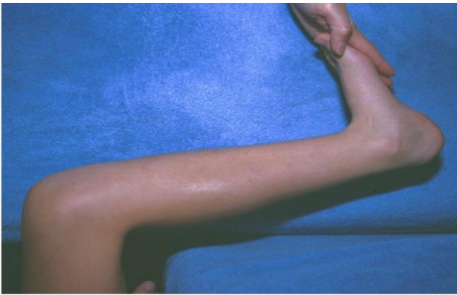
Fig. 2 A&B: The Silfverskiold test is used to evaluate the presence of gastrosoleus contracture by evaluating the muscles separately. A) With the knee bent and the foot held in talonavicular neutral, the ankle is passively dorsiflexed to judge soleus contracture with respect to ankle dorsiflexion. B) The knee is then straightened, and with the foot held in the same position, the ankle is again passively dorsiflexed. This measures the effect of the gastrocnemius muscle on the limitation of ankle dorsiflexion.