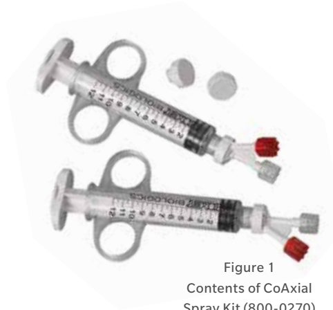
Figure 1 Contents of CoAxial Spray Kit (800-0270)