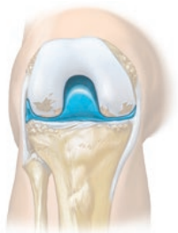
Osteoarthritic Knee with VISCO-3 Treatment