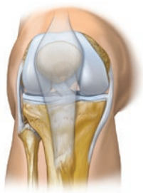
The Healthy Knee

Together, you and your doctor can determine the best treatment options for you. The good news is that osteoarthritis knee pain can be treated.