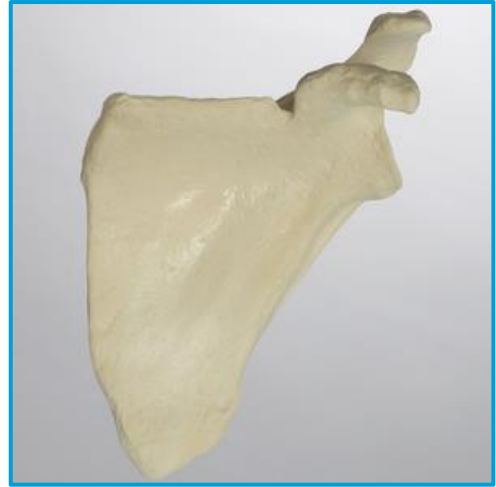
Figure 1: Sawbones Scapula Phantom to generate sample scan for site pre-qualification