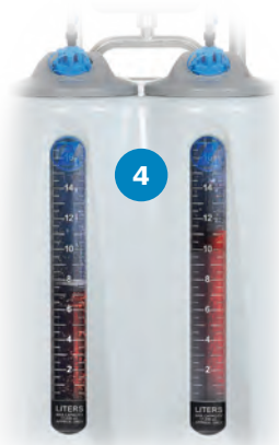
Reservoir windows with lights on/tint off