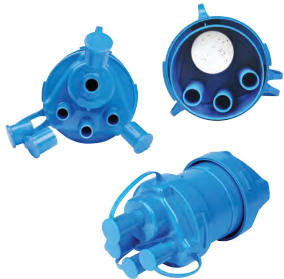
Single Use Manifold 00514020100