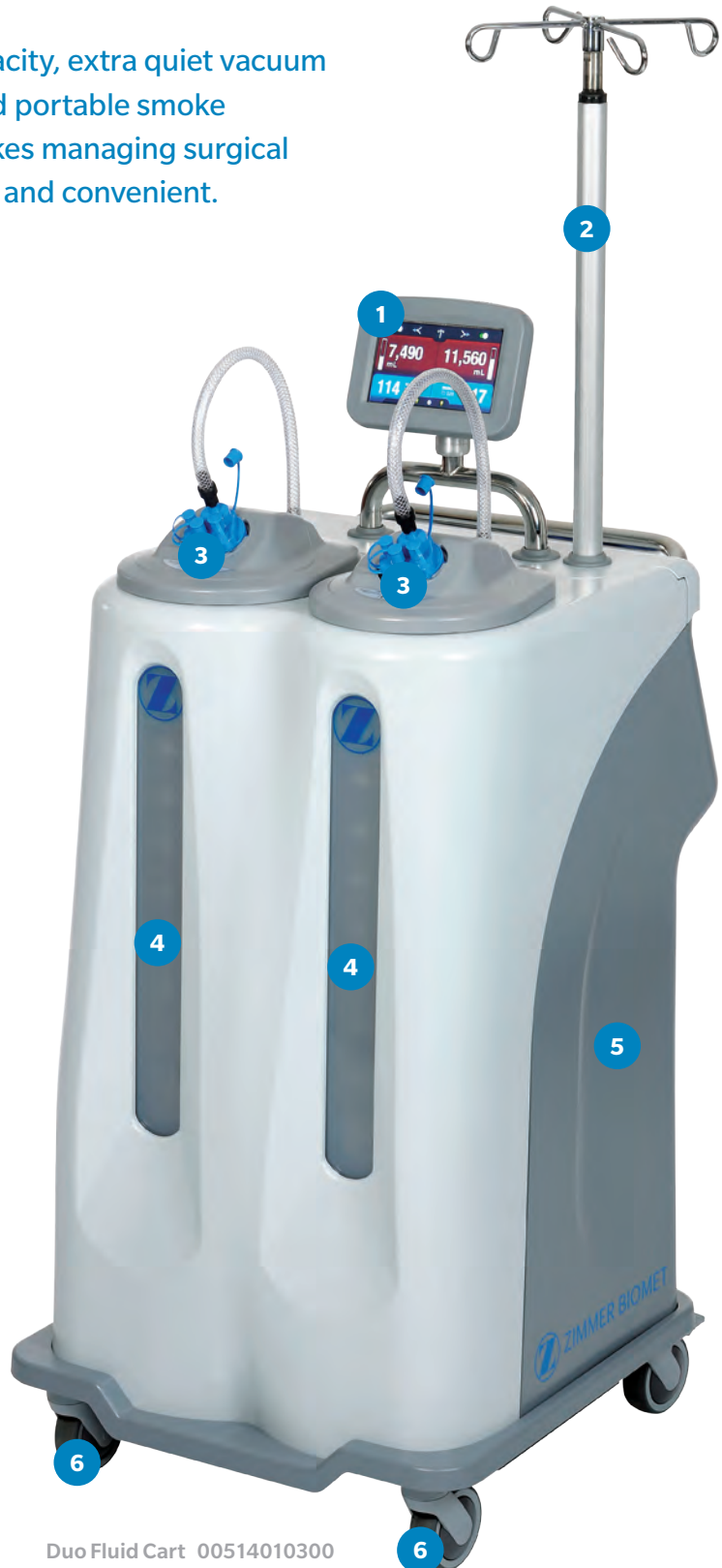
Duo Fluid Cart 00514010300