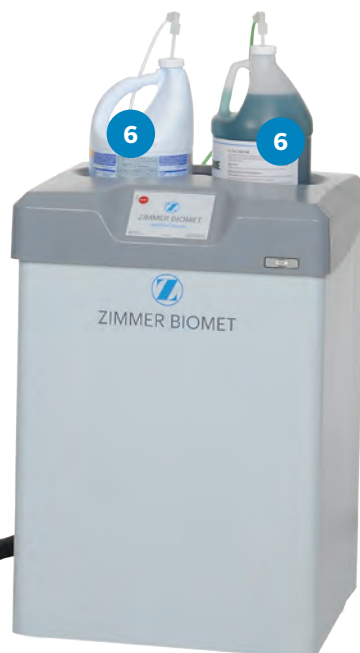
Evac Station 00514010900