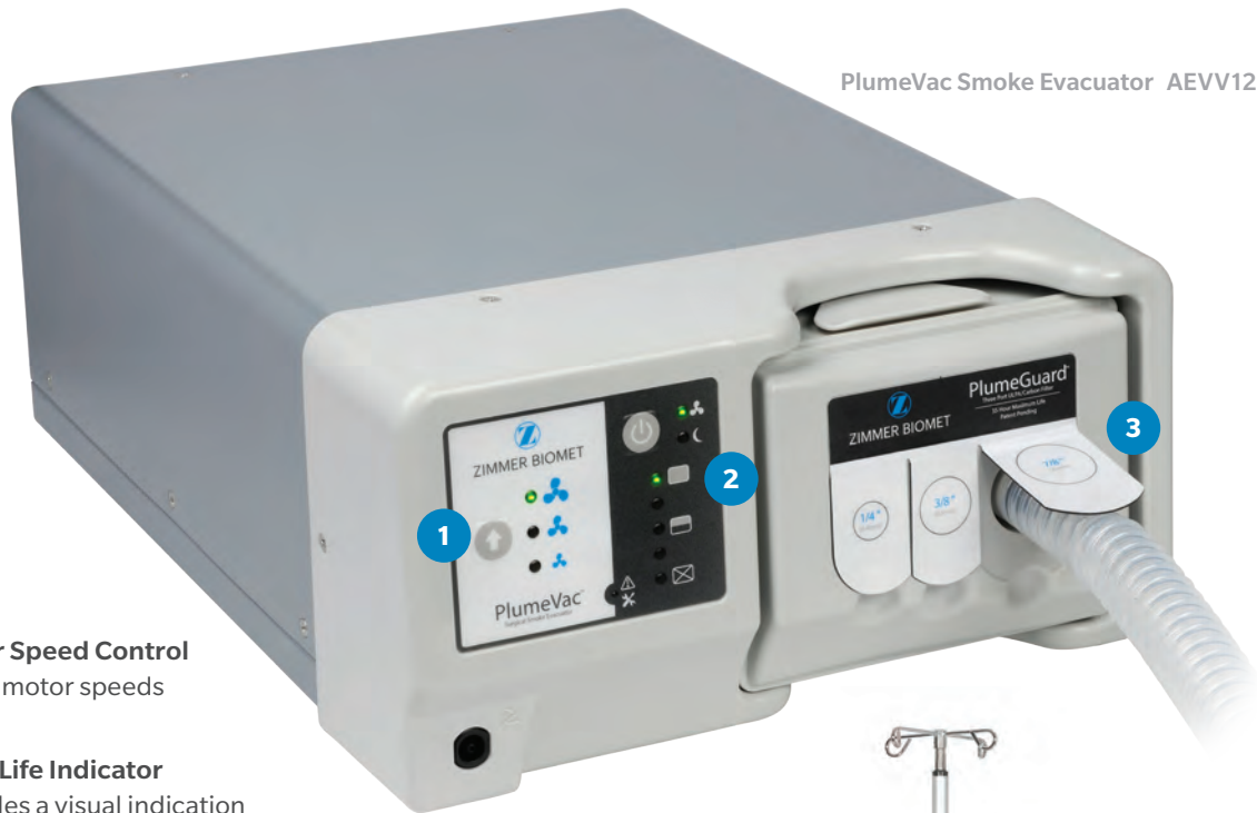
PlumeVac Smoke Evacuator AEVV120

The portable PlumeVac Smoke Evacuator gives you the flexibility to put smoke plume evacuation where you need it – on or off the cart.