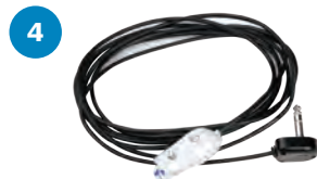
Automatic Activation Device AEAAD01