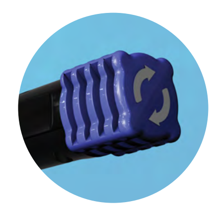
Rotate Deployment Knob