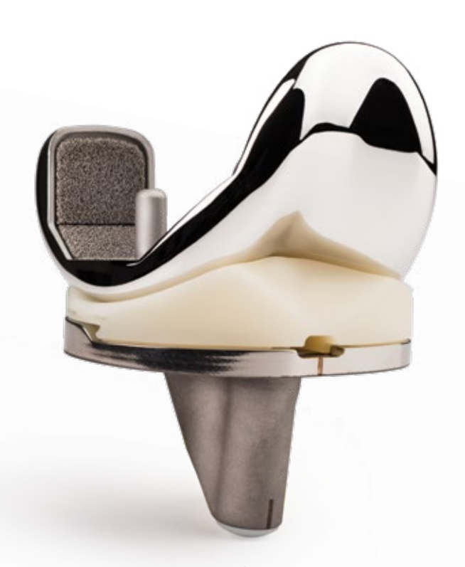
Persona Primary Knee