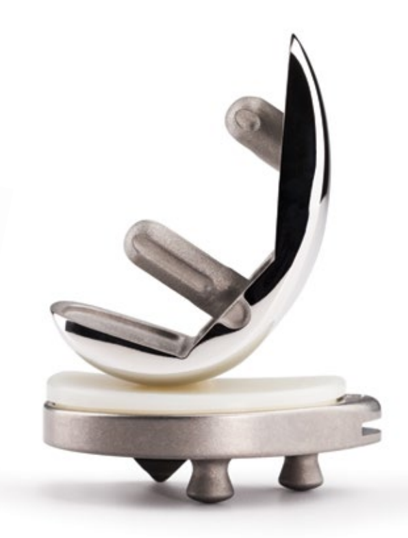
Persona Partial Knee