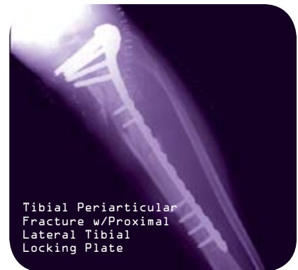
Tibial Periarticular Fracture w/Proximal Lateral Tibial Locking Plate