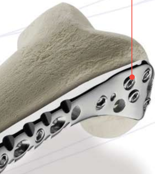
Periarticular Self-Tapping Cortical Bone Screw

The locking plate design does not require compression between the plate and bone to accommodate loading. Therefore, screw purchase in the bone can be achieved with a thread profile that is shallower than that of traditional screws. In turn, the shallow thread profile allows for screws with a large core diameter to accommodate loading with improved bending and shear strength.