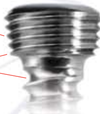
Head and shaft travel at same rate into plate and bone