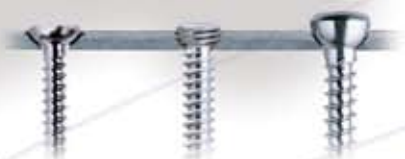
Periarticular 3.5mm Locking Screw

Zimmer Periarticular Locking Plate System components: