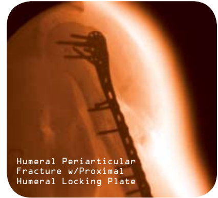
Humeral Periarticular Fracture w/Proximal Humeral Locking Plate